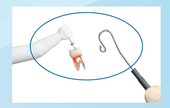
Insert rotary or reciprocating file into contra-angle and hang lip clip into patient's cheek pouch