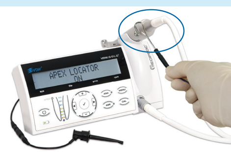
Touch micromotor with lip clip Display will show: APEX LOCATOR ON