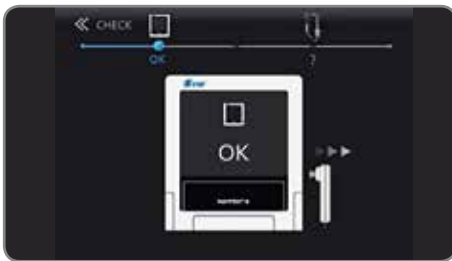
PLUG 'n CHECK: automated test of functions and cables